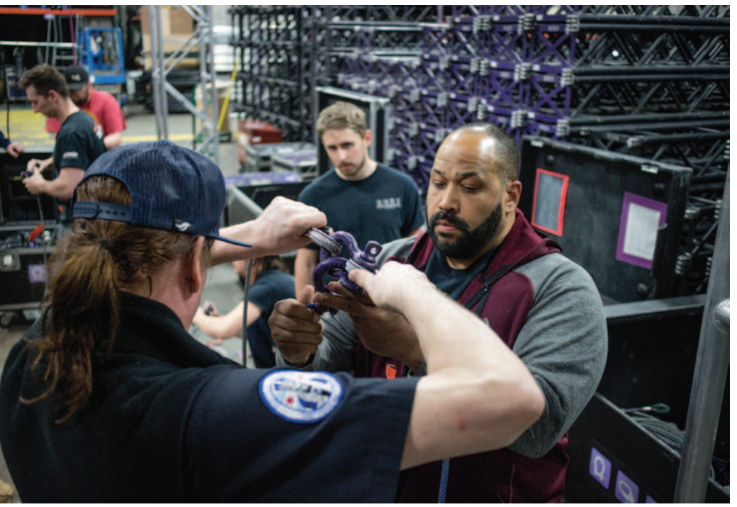
Instructors aren't the only source of information at Reed Rigging training events. Participants teach and learn from each other as well.