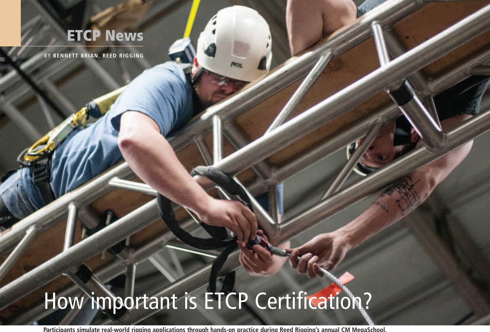
Participants simulate real-world rigging applications through hands-on practice during Reed Rigging's annual CM MegaSchool.

WHY, IT'S ALMOST AS IMPORTANT as spreading the word about ETCP Certification itself. Let's think for a moment about why we even have the ETCP. Is it for bragging rights about how well your test score measures up against your buddy's? Does it open doors for you to work in venues or on jobs that require ETCP Certification? Will your email signature be that much cooler with the addition of the logo? Obviously, those questions are all easily answered "Yes," but none of them addresses the most important value of ETCP Certification—Safety. It's easy to throw around safety as something we strive for on each event, but safety doesn't happen by accident. Just as we all had a learning curve when we first started on the job, practicing safety is something that is learned and takes effort.