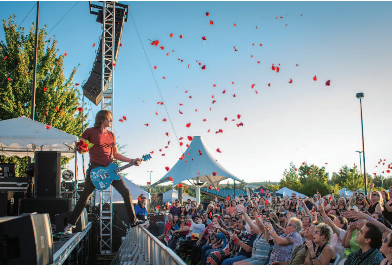
Rick Springfield at the Tulalip Amphitheater in Washington. Rigging, labor, production management, roof, stage barricade, lighting, and video support provided by Pyramid Staging.