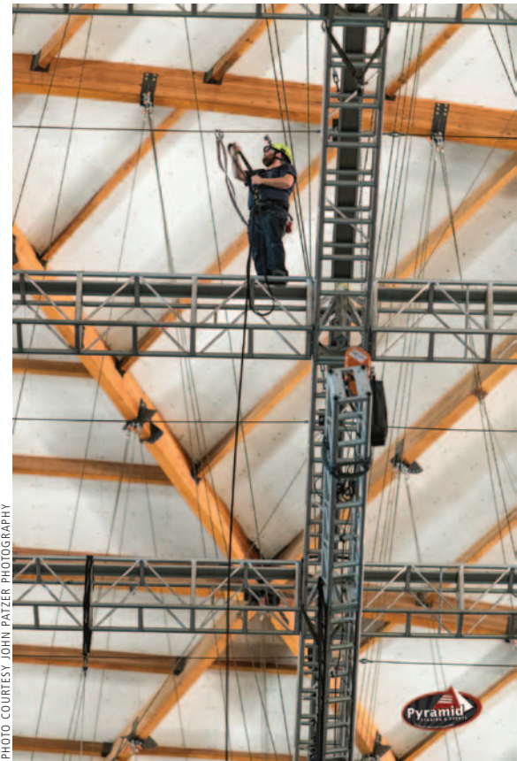
Pyramid rigging team installing a Monster Truck show at the Tacoma Dome, January 2015.

2013 through the first quarter of 2015 has seen an unprecedented growth in Seattle of both acceptance and technicians becoming ETCP certified. As of this writing, there are 53 ETCP certified riggers or electricians in