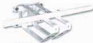
ML Bracket 2003 LDI Lighting Accessory of the Year