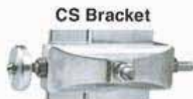
CS Bracket Attach to Clear Span Tents Not For Overhead Lifting!

TENTTEC Hanging around tents has never been easier www.tenttec.com