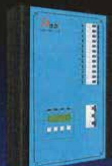
Professional Dimmer/Relay 6-24 Channels Dimmer 6-24 Channels Relay for Hotel, Theater, Shopping Mall

Save Energy Convenient Project & Application Software