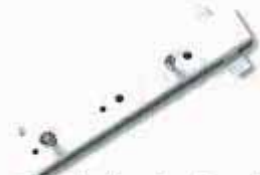
Perimeter Bracket Lighting solution for frame tents