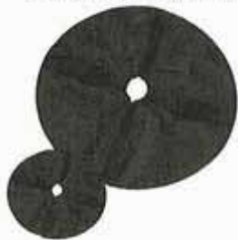
Mini-O (8 lbs)