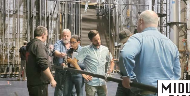
Hands-on rigging inspection training