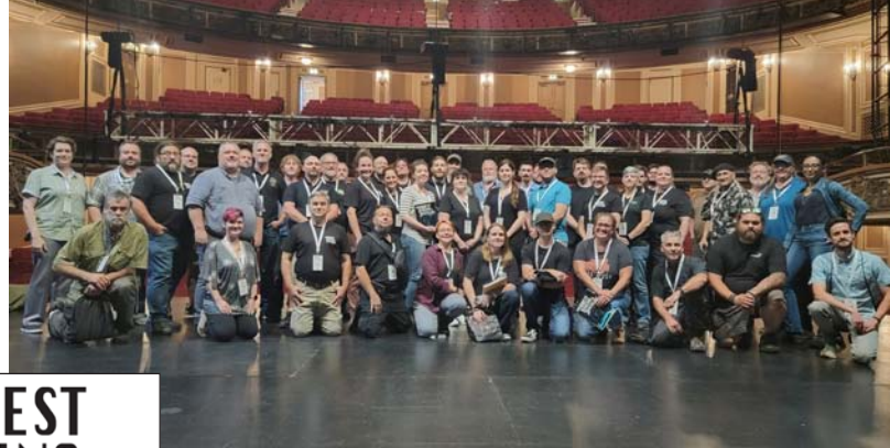
The MRI Class of 2022